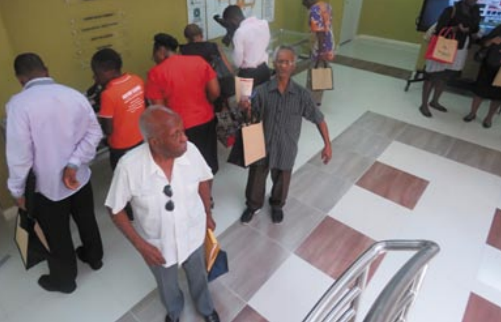
Specially invited guests viewing the archival exhibition